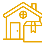
HOME DELIVERY & CONSULTATIONS