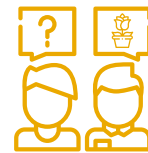
LAWN & GARDEN CLIENTELING

Our recommended locking solutions for DIY and Home Improvement settings are part of InVue's OneKEY ecosystem™, a storewide single-key solution that increases sale, decreases theft and promotes associate safety.