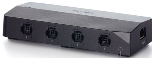
Large Power Box