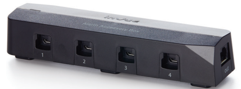
Alarm Accessory Box