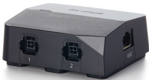
Small Power Box