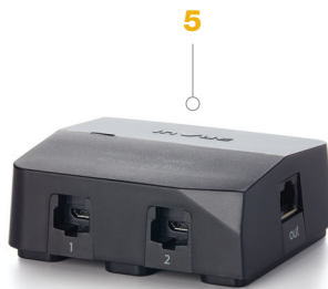
Alarm + Power Accessory Box